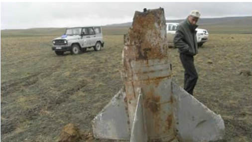
Inert debris from large rocket body buried 2 m deep

Prior to clearance work, Azerbaijan National Agency for Mine Action preparations (March – May 2012) included training and equipping the 48 man demining/EOD workforce, clearance to allow safe movement of the workforce into the area, the establishment of a temporary logistic base close to the area and development of detailed clearance plans. Phase I (April 2012 – July 2014) cleared UXO and mines from 19 Sq Km of the western section using two mechanical clearance machines (Bozena-5) and four mine detection dog teams for the 7 Sq Km minefield, and up to ten manual EOD teams for the remaining 11 Sq Km UXO area.