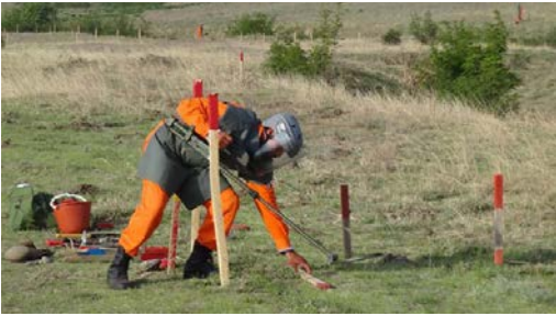
Manual clearance work