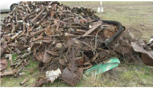
Recovered range scrap awaiting disposal