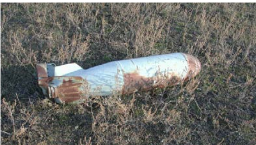
Airdropped bomb requiring clearance