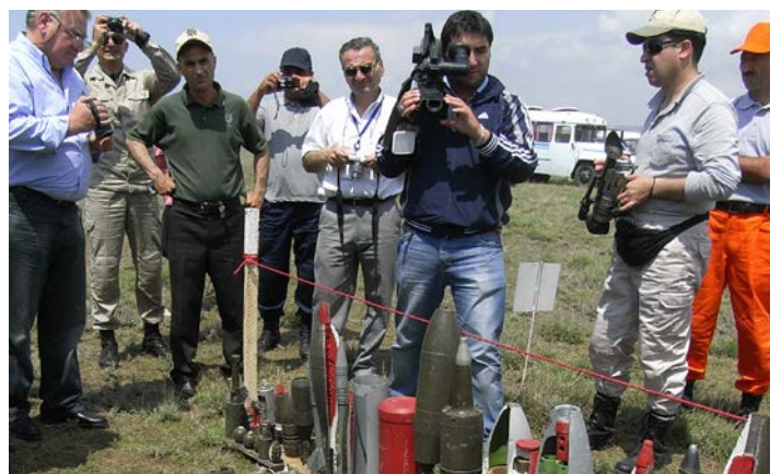
Media at Jeyranchel opening 9 May 2012