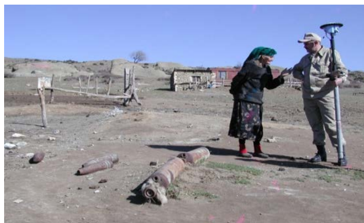
Local inhabitant amongst EOD, 2009